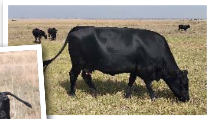
↓ Monja Esterhuizen