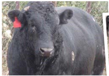
↓ A few of Mobaza's cattle